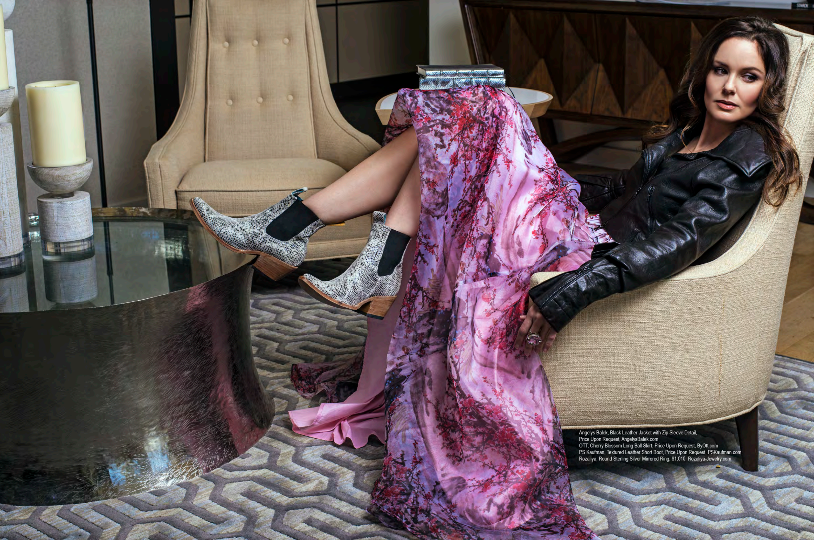
Angelys Balek, Black Leather Jacket with Zip Sleeve Detail, Price Upon Request, AngelysBalek.com OTT, Cherry Blossom Long Ball Skirt, Price Upon Request, ByOtt.com PS Kaufman, Textured Leather Short Boot, Price Upon Request, PSKaufman.com Rozaliya, Round Sterling Silver Mirrored Ring, $1,010 Rozaliya-Jewelry.com