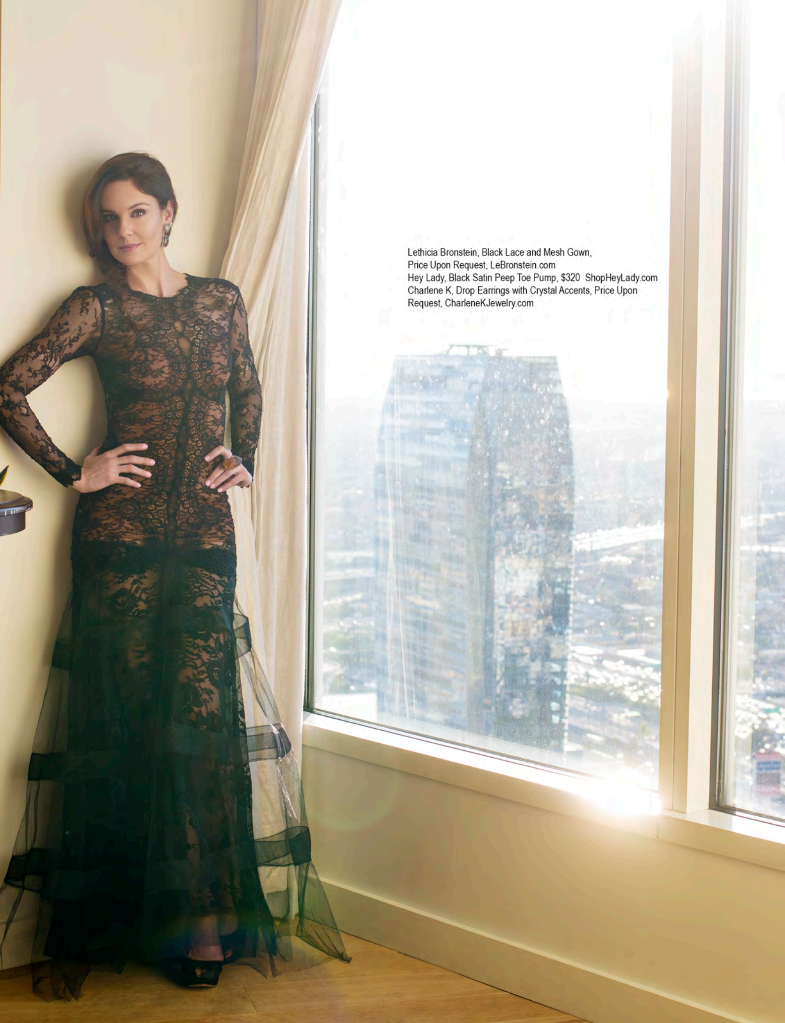
Lethicia Bronstein, Black Lace and Mesh Gown, Price Upon Request, LeBronstein.com Hey Lady, Black Satin Peep Toe Pump, $320 ShopHeyLady.com Charlene K, Drop Earrings with Crystal Accents, Price Upon Request, CharleneKJewelry.com