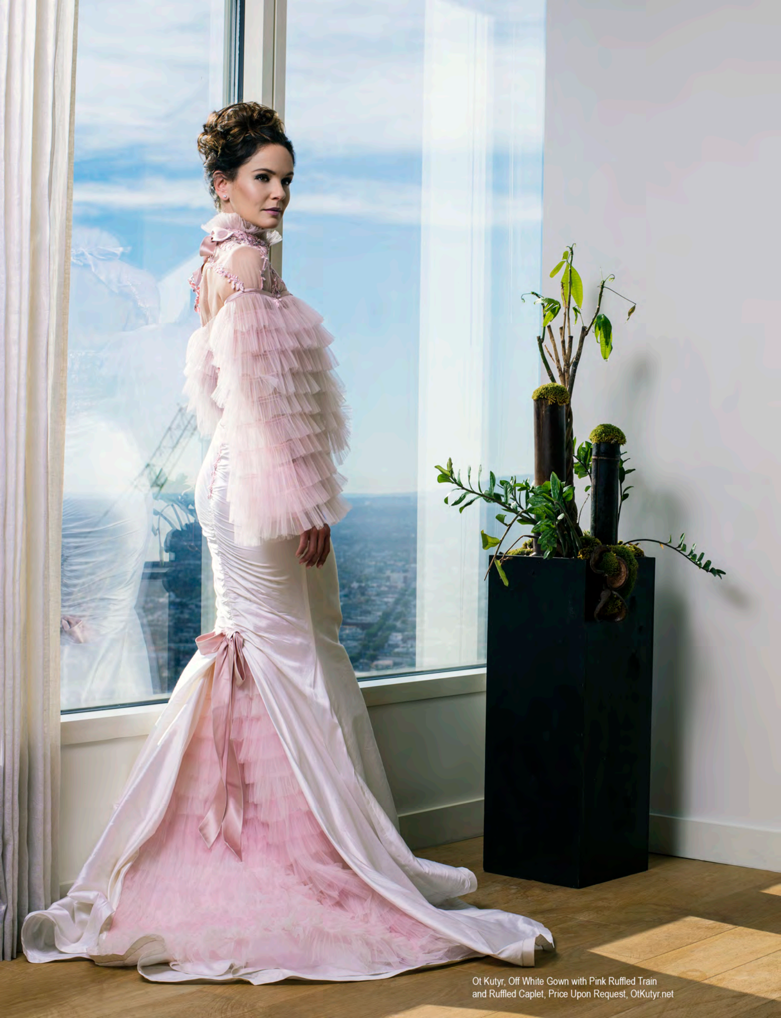
Ot Kutyr, Off White Gown with Pink Ruffled Train and Ruffled Caplet, Price Upon Request, OtKutyr.net