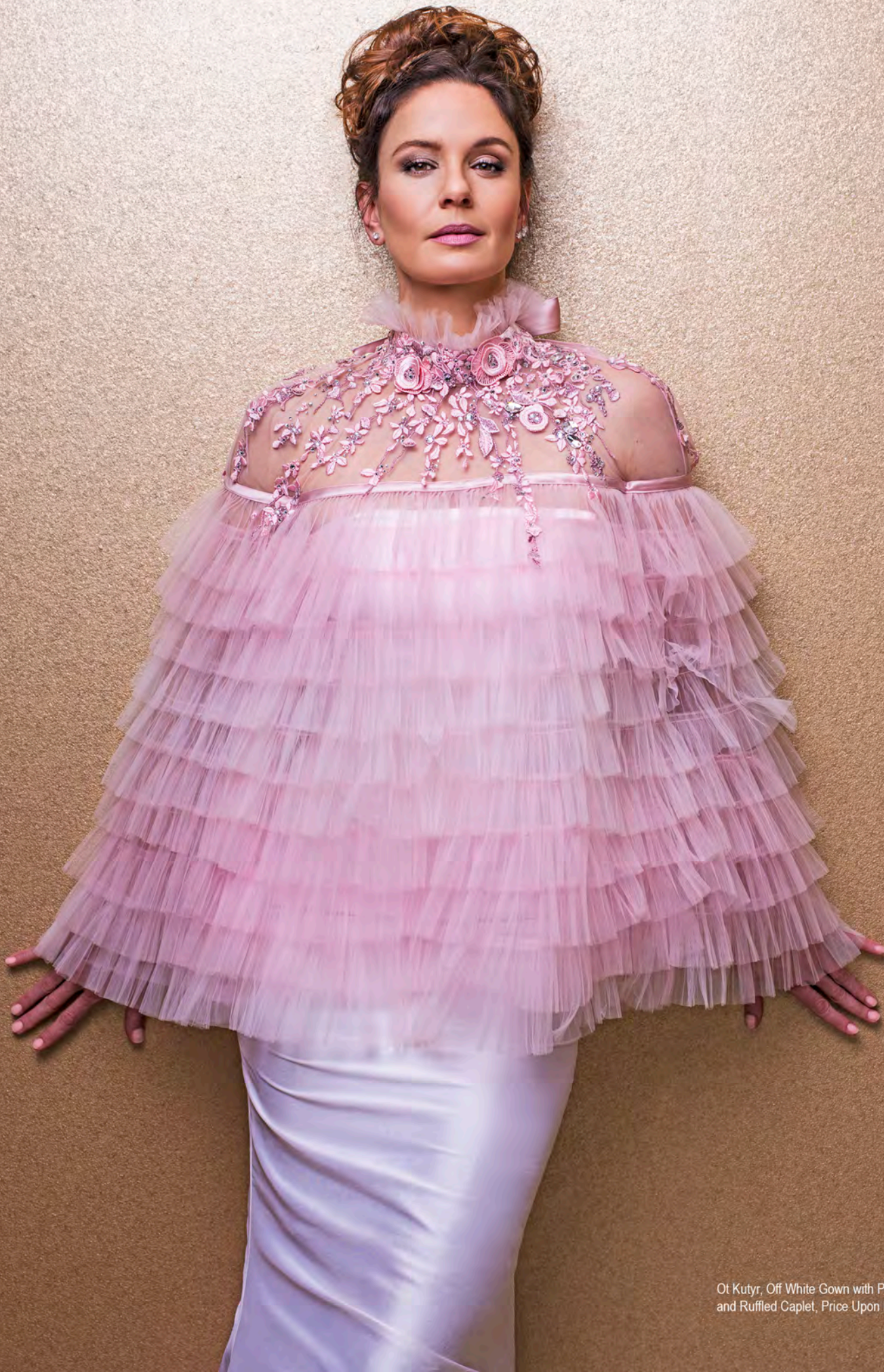
Ot Kutyr, Off White Gown with Pink Ruffled Train and Ruffled Caplet, Price Upon Request, OtKutyr.net